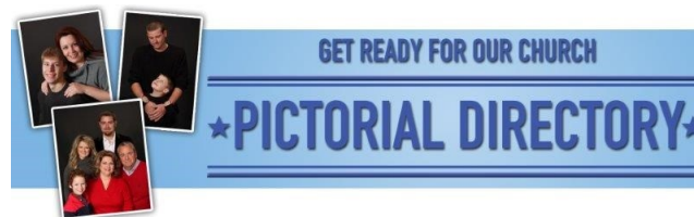
Photo dates are April 28-30.